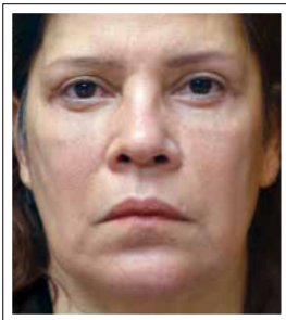
A Bright New Look